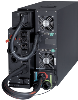
9PX 11kVA with Maintenance ByPass